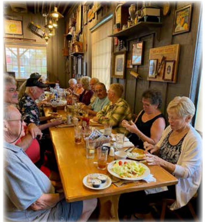
The October Veterans' luncheon was held October 11th at Cracker Barrel Restaurant with 20 Veterans and their spouses attended.